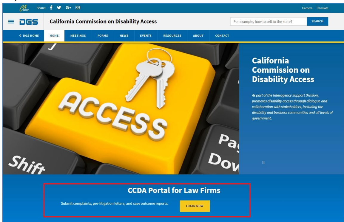
Picture 1. The location of the online submission portal on CCDA's website.

Since the launch of the online submission portal, CCDA has 23 law firms and 34 different users currently registered. In the month of December 2019 alone, CCDA has received 164 Pre-litigation Letter and Complaint submissions. Staff anticipate the number of submission to increase as the system becomes more optimized and user friendly.