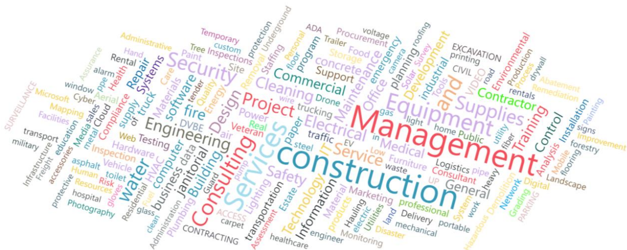
Figure 5. DVBE Keyword Cloud Map

In the word cloud map, the keywords for the service industry categories most frequently used by DVBEs are identified. The size and scale of the word is determined by how often