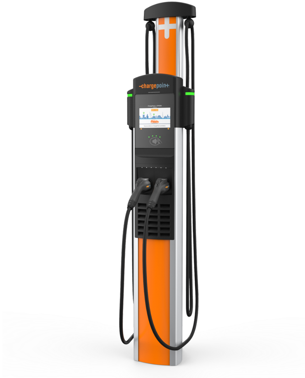
Dual port, pedestal mount, 18 ft cable