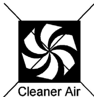
Figure 11B-703.7.2.5 Cleaner Air Symbol (end strikeout) (end italic)

The symbol, which shall include the text “Cleaner Air” as shown, shall be displayed either as a negative or positive image within a square that is a minimum of 6 inches (152 mm) on each side. The symbol may be shown in black and white or in color. When color is used, it shall be Federal Blue (Color No. 15090 Federal Standard 595B) on white, or white on Federal Blue. There shall be at least a 70-percent color contrast between the background of the sign from the surface that it is mounted on.