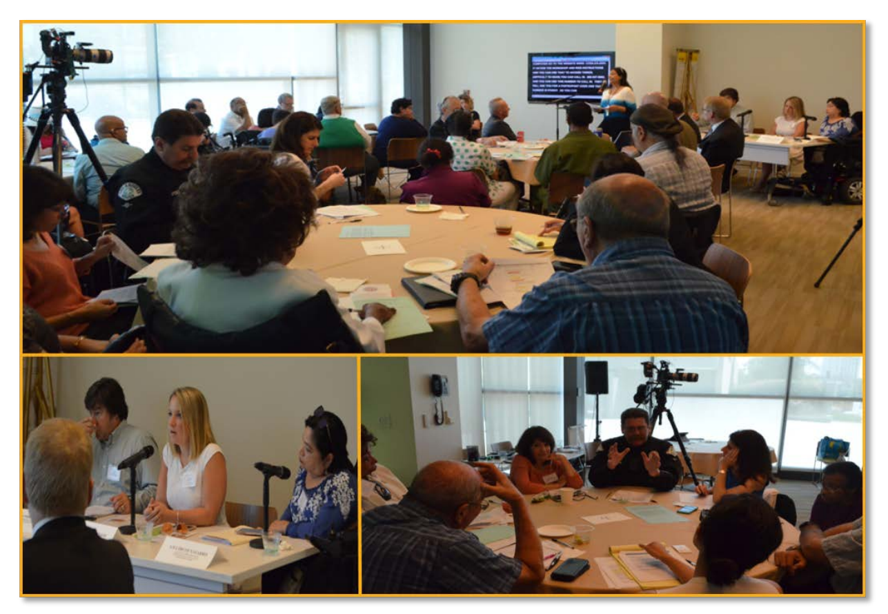
The top portion of the above image features a presentation given at the DMV Disabled Parking Placard Program Listening forum. The lower left image is of the panel from the forum, and the lower right mage is of a small group discussion from the forum.