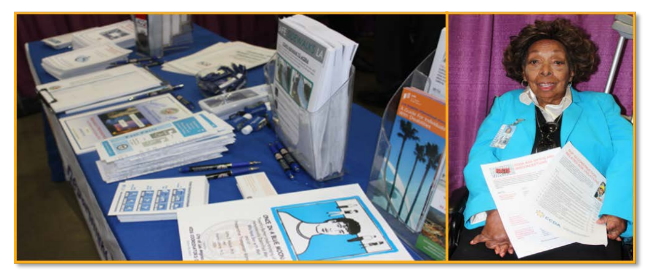
The images above are from the Los Angeles Abilities Expo. On the left is a picture of the display table; on the right is a picture of Commissioner Wilson.

Strategic Goal: Development of a State-Level ADA Access Function/Policy Information, resources, and compliance support for access and accommodation