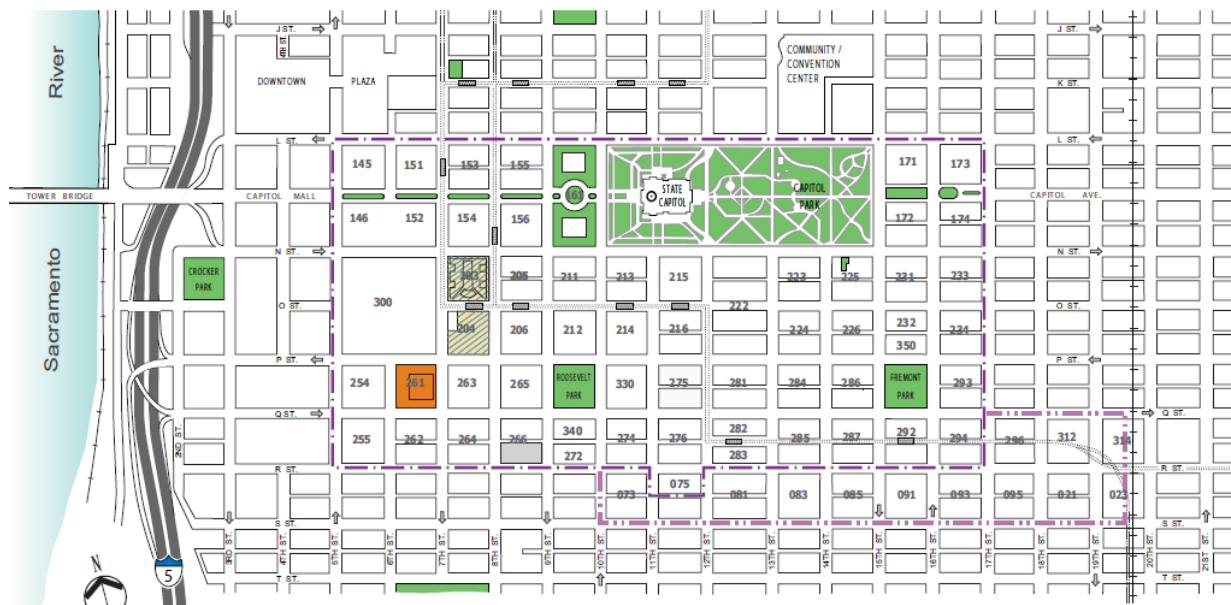
Location Map Capitol West Side Projects