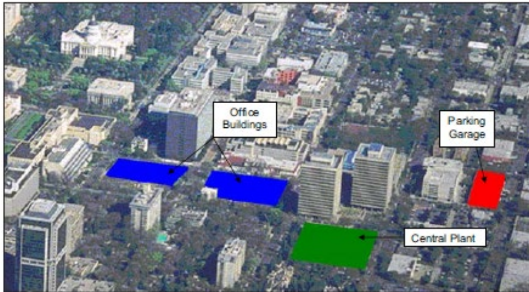
Capitol West Side Projects Sites

and would offer the opportunity to construct a signature building complex in its west end to complement the East End Complex. The project, when completed, would provide additional consolidation opportunities for agencies requiring a downtown location, advancing the implementation strategies of the 1997 Sacramento Regional Facilities Plan. The Resources Agency, including six of its departments, was identified as the tenant for the office project.