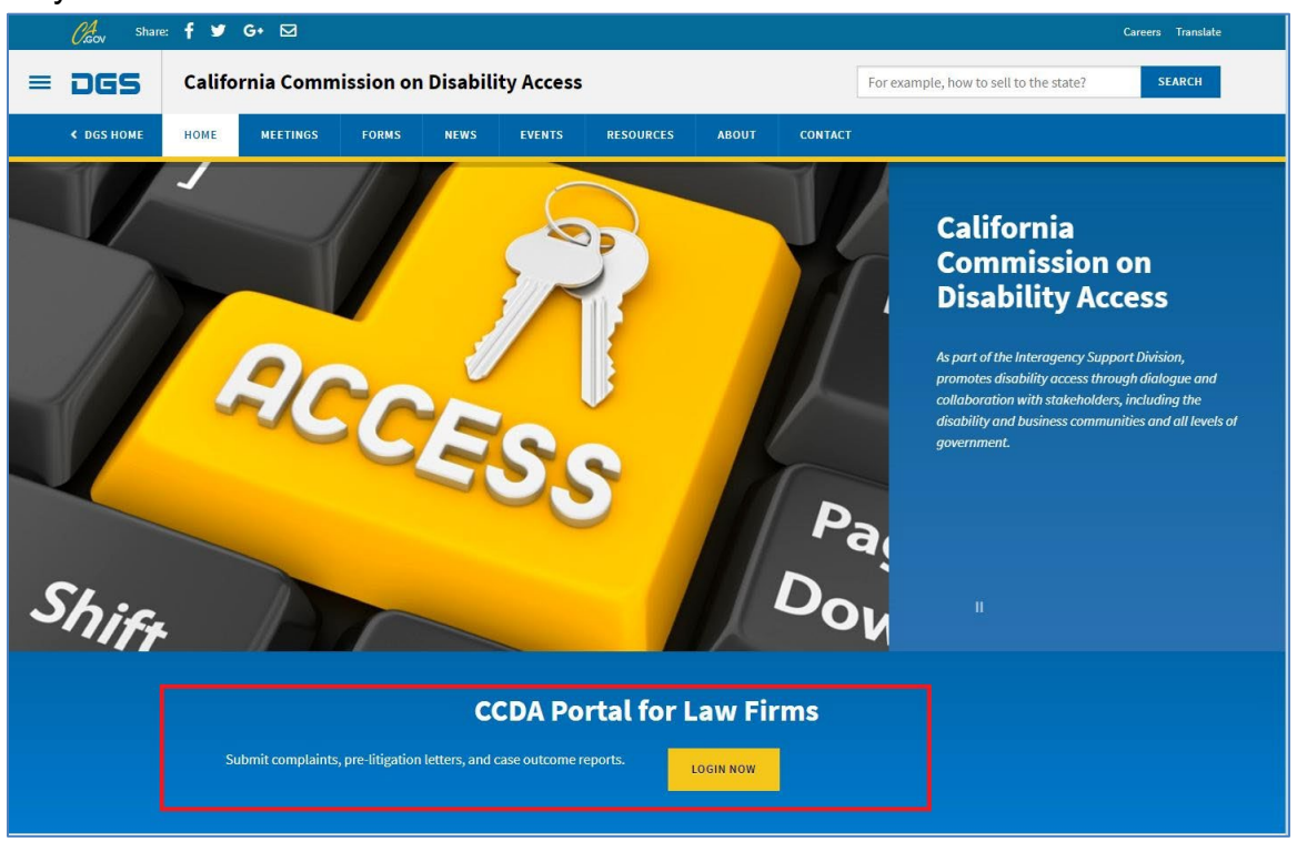
Picture 1. The location of the online submission portal on CCDA's website.

Since the launch of the online submission portal, CCDA has 23 law firms and 34 different users currently registered. In the month of December 2019 alone, CCDA has received 164 Pre-litigation Letter and Complaint submissions. Staff anticipate the number of submission to increase as the system becomes more optimized and user friendly.