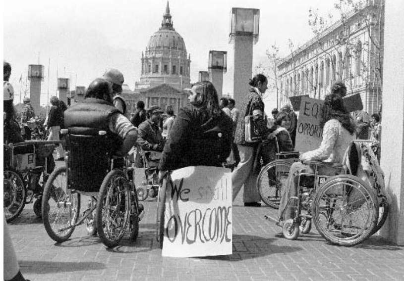
Image: Wheelchair users protesting outside of San Francisco City Hall in 1977. One protester has a hand-made “We Shall Overcome” sign on the back of his wheelchair (black and white.)