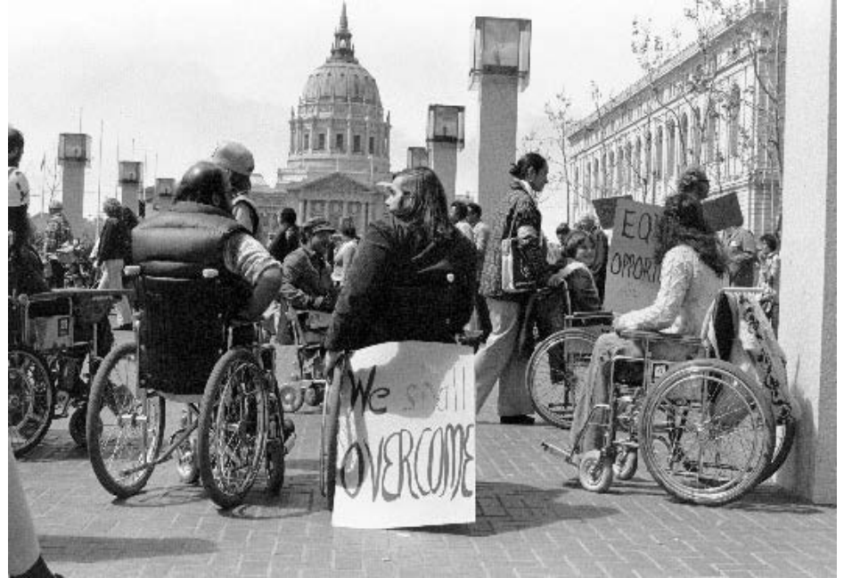
Image: Wheelchair users protesting outside of San Francisco City Hall in 1977. One protester has a hand-made “We Shall Overcome” sign on the back of his wheelchair (black and white.)