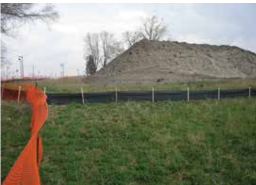
Stockpiled Excavation Material

On-site enforcement: The inspector should verify that the list of universal waste materials shown on the construction documents is being disposed of properly. The inspector may ask for haul tags and/or reports from the contractor to verify compliance with the code. Verification by documentation from a waste management company or recycling facility is acceptable.