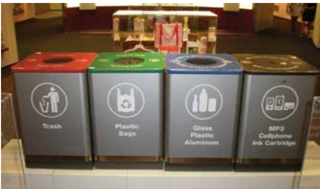
Recycling by Occupants

Note: A sample ordinance for use by local agencies may be found in Appendix A of the document at the CalRecycle’s web site.