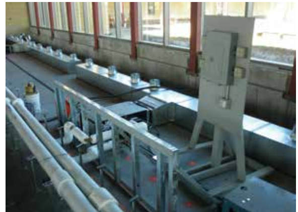
Mechanical Ventilation for Occupied Spaces

On-site enforcement: The inspector should verify that HVAC filtration specified on the approved construction document is installed or is stored on-site, with proper labeling. The inspector may check a sample of installed filters to verify the MERV rating and labeling requirements.