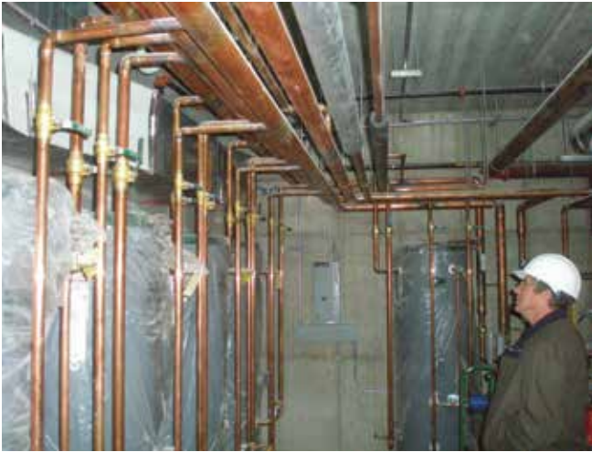
Verification of Systems

the building components tested, the testing methods utilized, and include any readings and adjustments made.