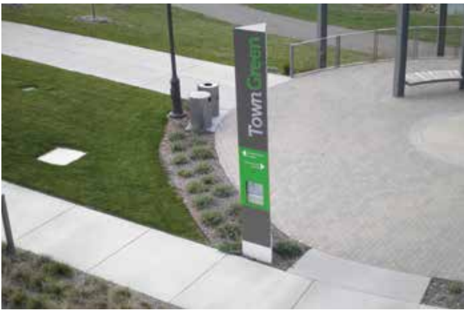
Reduction in Heat Island Effect

A5.106.11.3 Verification of compliance. If no documentation is available, an inspection shall be conducted to ensure roofing materials meet cool roof aged solar reflectance and thermal emittance or SRI values.