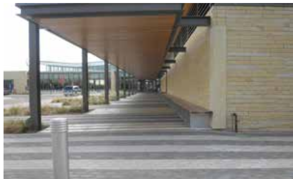
Site Grading and Paving

The intent of this code requirement is to ensure that newly constructed project sites, additions and alterations that redefine drainage paths are planned and developed to keep surface water from entering the building to extend the longevity of the exterior building walls and to keep moisture from entering the exterior wall and perimeter floor systems. (See Chapter 3 for exceptions for additions and alterations.)