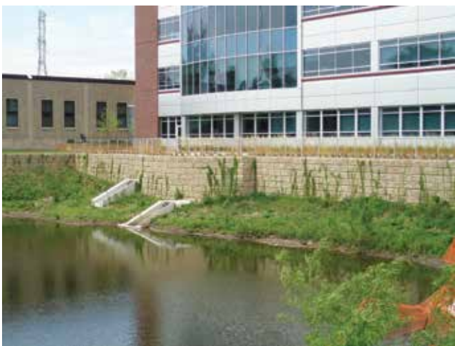
Storm Water Design

Always check with local jurisdiction regarding existing ordinances for these provisions.