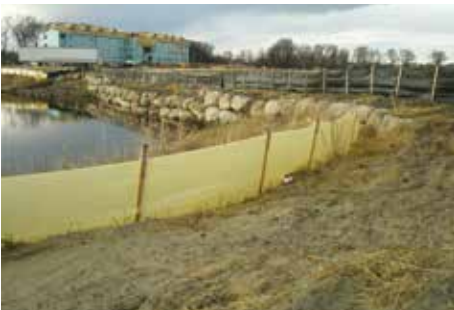
Soil Erosion Control