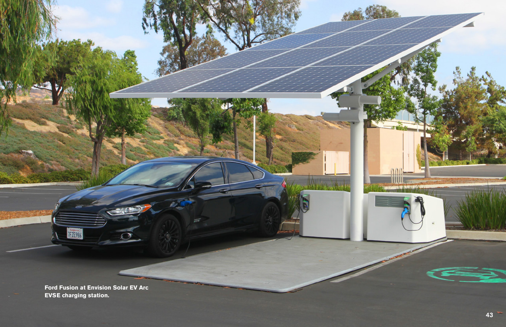
Ford Fusion at Envision Solar EV Arc EVSE charging station.