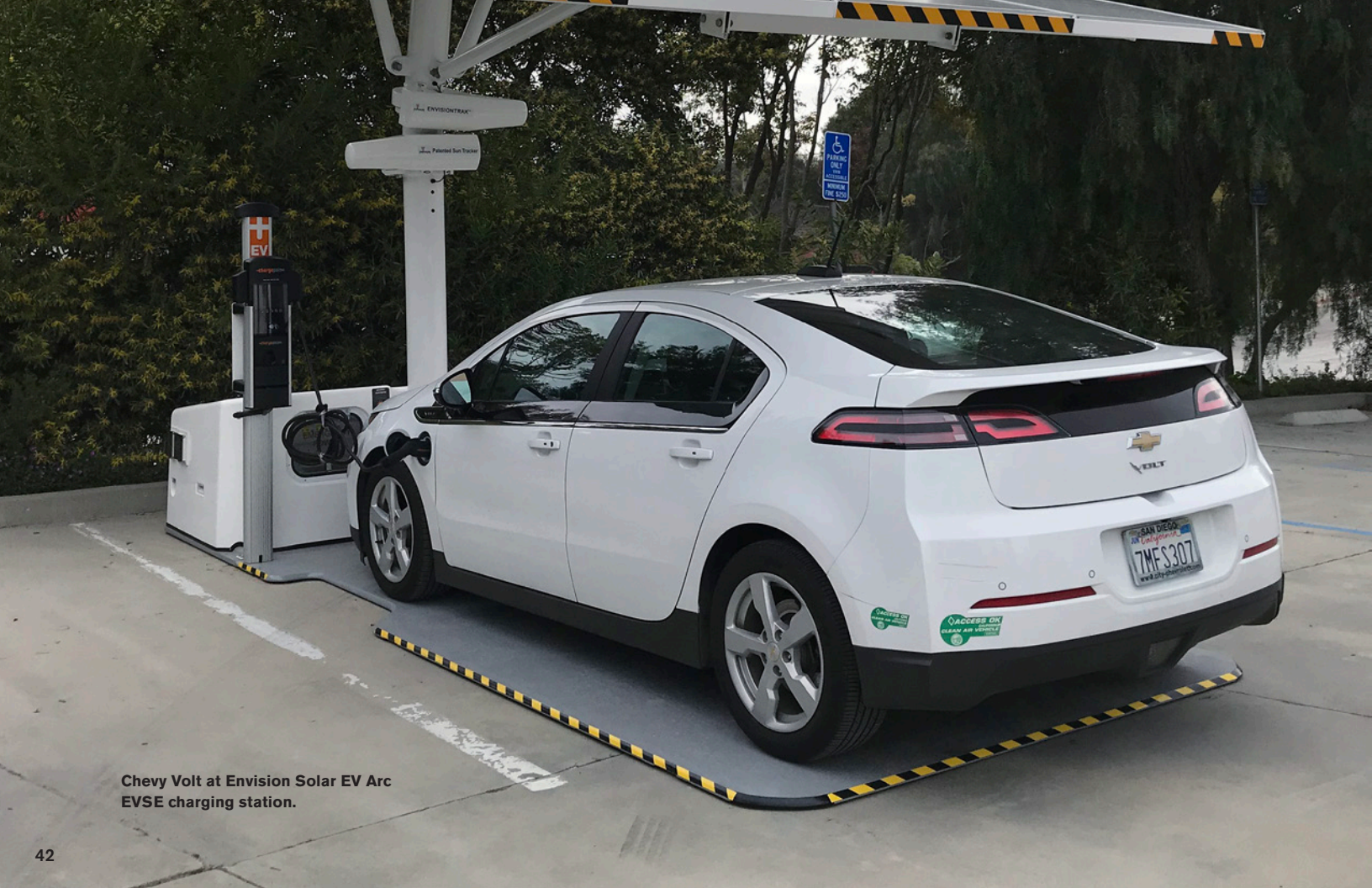
Chevy Volt at Envision Solar EV Arc EVSE charging station.