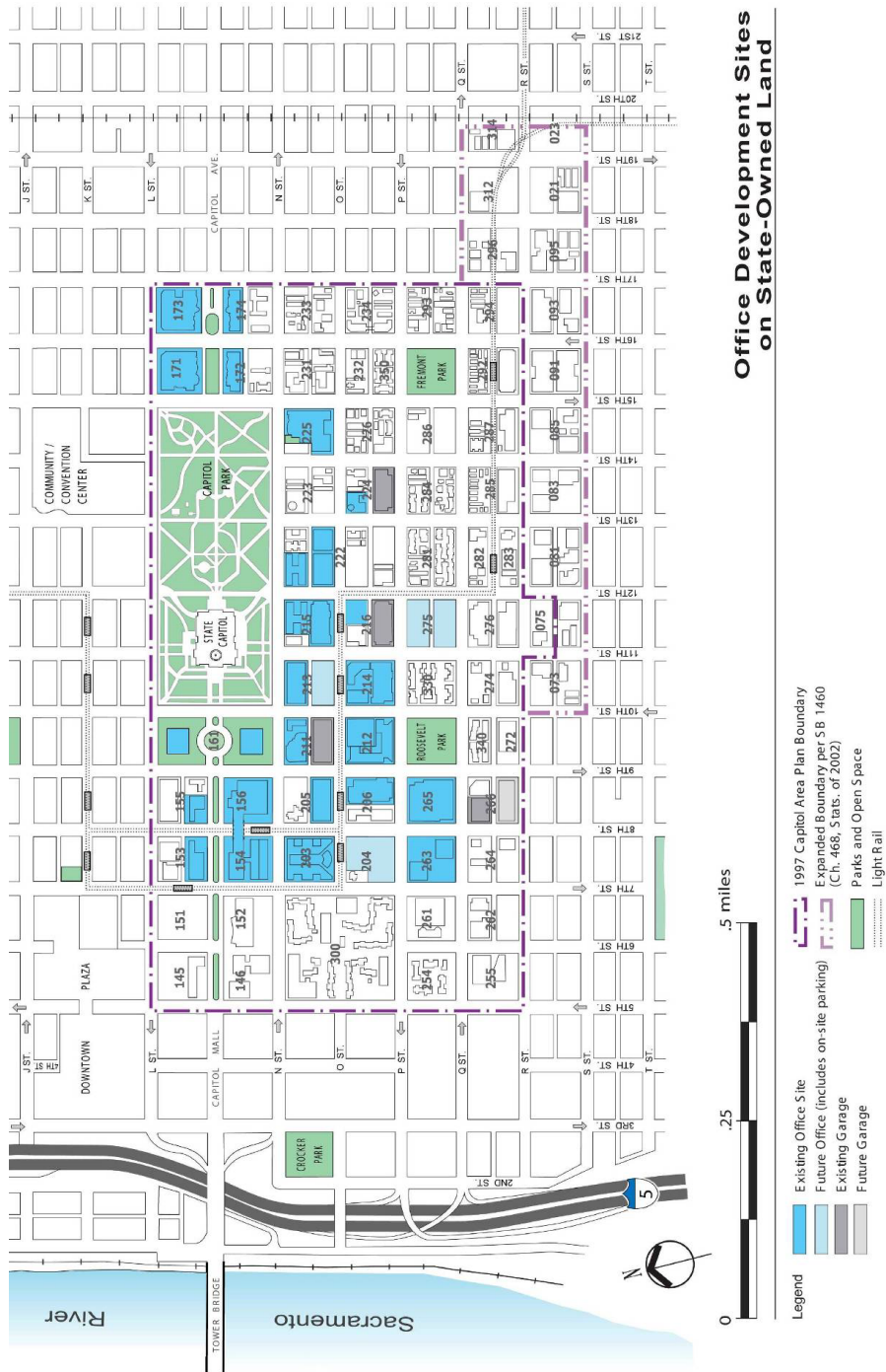
Office Development Sites on State-Owned Land

of the Capitol Area, and supplies over one million SF of office space to State agencies in the Capitol Area. The sale-leaseback was designed to free up the State's equity in the buildings to provide revenue for addressing the State's budgetary shortfall, while allowing the State to retain use of the properties. In October 2010, the Director of DGS submitted the 30-day notification to the State Legislature of the Department's intent to sell the properties, as required by the authorizing legislation. However, after taking office in 2011, Governor Brown halted the sales and no further action has been taken in relation to this sale-leaseback effort.